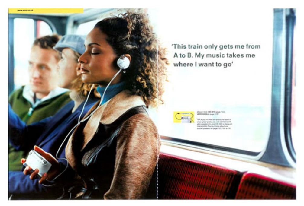
2. Advert for a portable Sony Minidisc player, c. 2002

through this station and through your plans, and no, it would not be able to reverse and the only thing to do, therefore, was wait until the next one came along.