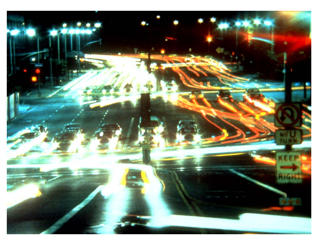
3. Godfrey Reggio, Koyaanisqatsi

grained 'reality' of the city given content by subjective movements. Yet, it is the objective views that carry much weight, and that are omnipresent due to the representations of photography, maps and even 3D models (of the kind one might see in a tourist office). Particularly interesting versions of this kind of objectification might be observed in the cityscapes captured by use of the moving image, which correspondingly reveal the shifting surface of the urban topos. In Godfrey Reggio's 1983 documentary Koyaanisqatsi , a film that glories in the endless trafficking of urban movement within contemporary life, we gain an insight into a perspective that surpasses the abstraction of the map as representation of the city, one we may suggest that corresponds to the vision of an all-seeing God (or, indeed, the Hobbesian sovereign). What we notice is that because of the distance of the viewing eye (the camera) the motions observed from this perspective fail to register the insignificant and irregular deviations from the largely well-ordered norm, present-