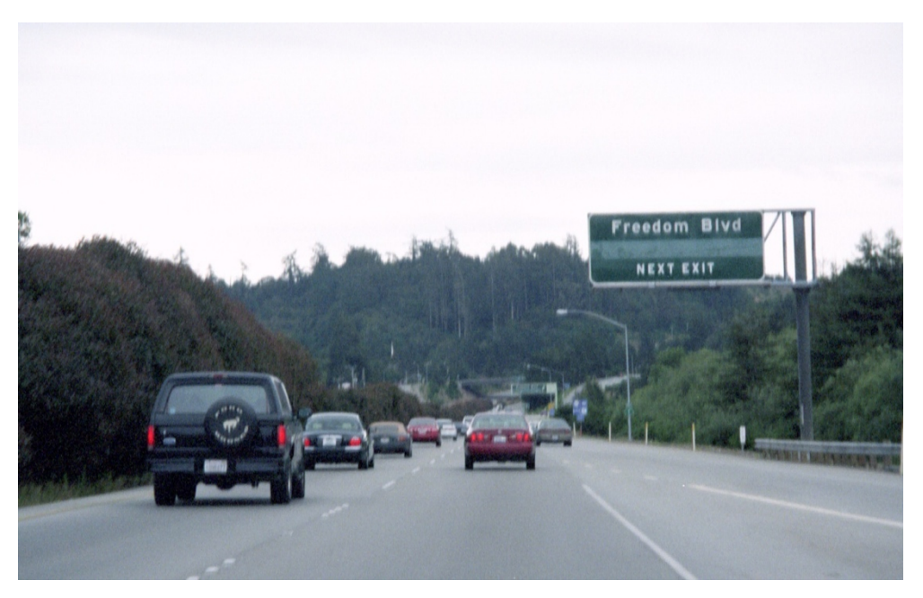
1. Trafficking on Route 1, near Soquel, California, 2000 (John Scanlan)

Hobbes is perhaps an unusual point of departure in positing the causes of our experience of traffic as the merely instrumental means to an end, but the work of this thinker, who died several centuries ago, illuminates our speculations on why our trafficking – particularly the spaces between stations and the space of movement – can be so forgettable. Within the Hobbesian elaboration of materialist psychology we can glimpse how the subjective control of what he called 'internal motions' becomes, precisely because of the consequences of our objective social existence, the basis for social relationships, which first propel individual movement and then shunt it towards some rational convergence of interests. We might say, then, that in the relation of individual to world a certain element of passivity develops as a result of the displacement of obligations onto the hypothetical sovereign (which, in modern terms we read as the dispersed 'machinery' of society; the division of labour, knowledge, and other such convergences of interest). What relates to our contemporary understanding of how passage is mediated through space is