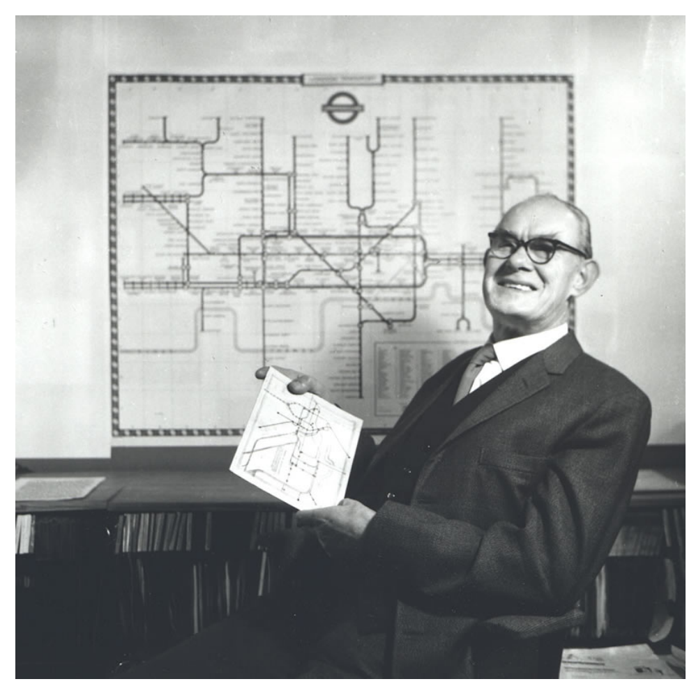
4. Harry Beck with his London Underground map

For all its clarity, it is highly misleading; unlike the previous maps, which represented stations in their correct geographical positions, the new map not only reorganised the lines along horizontal, vertical or 45 degree axes, but also enlarged the distance between the stations in the central area, and reduced that between stations in the outer area ... by making the distance between the suburbs and the centre look so small [it] induced people to undertake journeys they might have otherwise hesitated to make (Forty, 1986: 237).