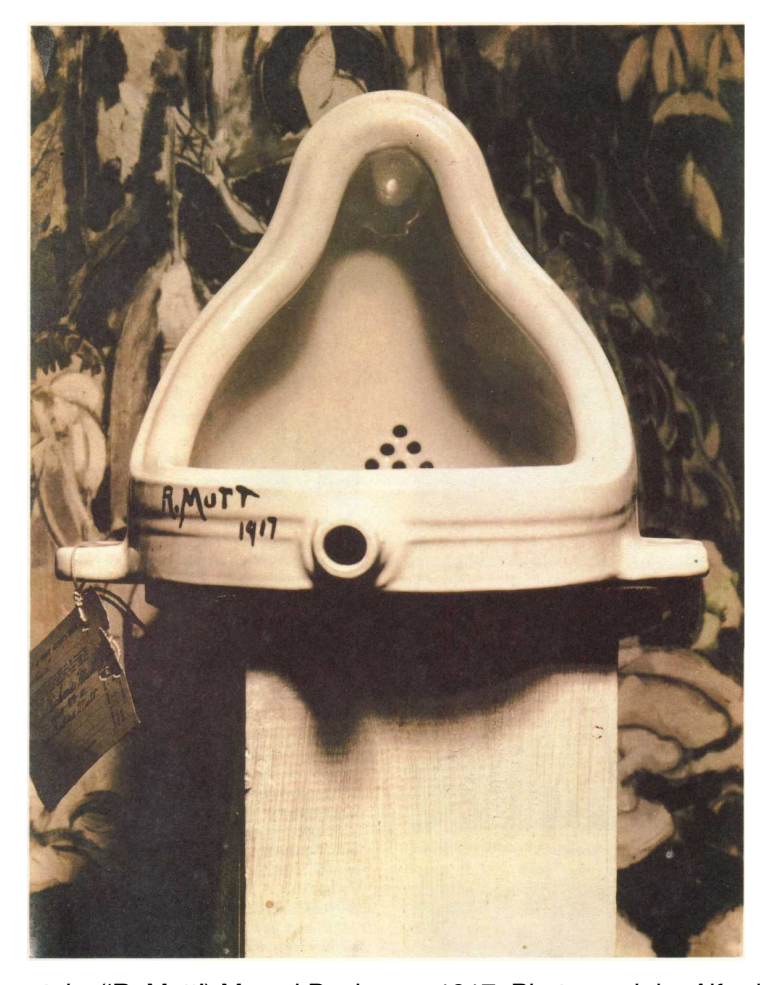
1. Fountain, ('R. Mutt') Marcel Duchamp, 1917.

and because of the suggestion of impropriety, to have clothed male figures presented alongside the nude figure of a female as Manet had depicted.