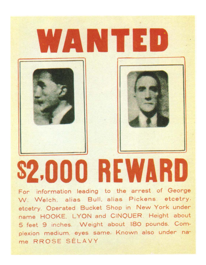
3. Wanted/$2000 Reward, Marcel Duchamp, 1923.

mug-shot introduces a concealed but significant breach, a representation that does not promote an affirmation of identity but of false identity (Stoichita, 1997: 226-27).