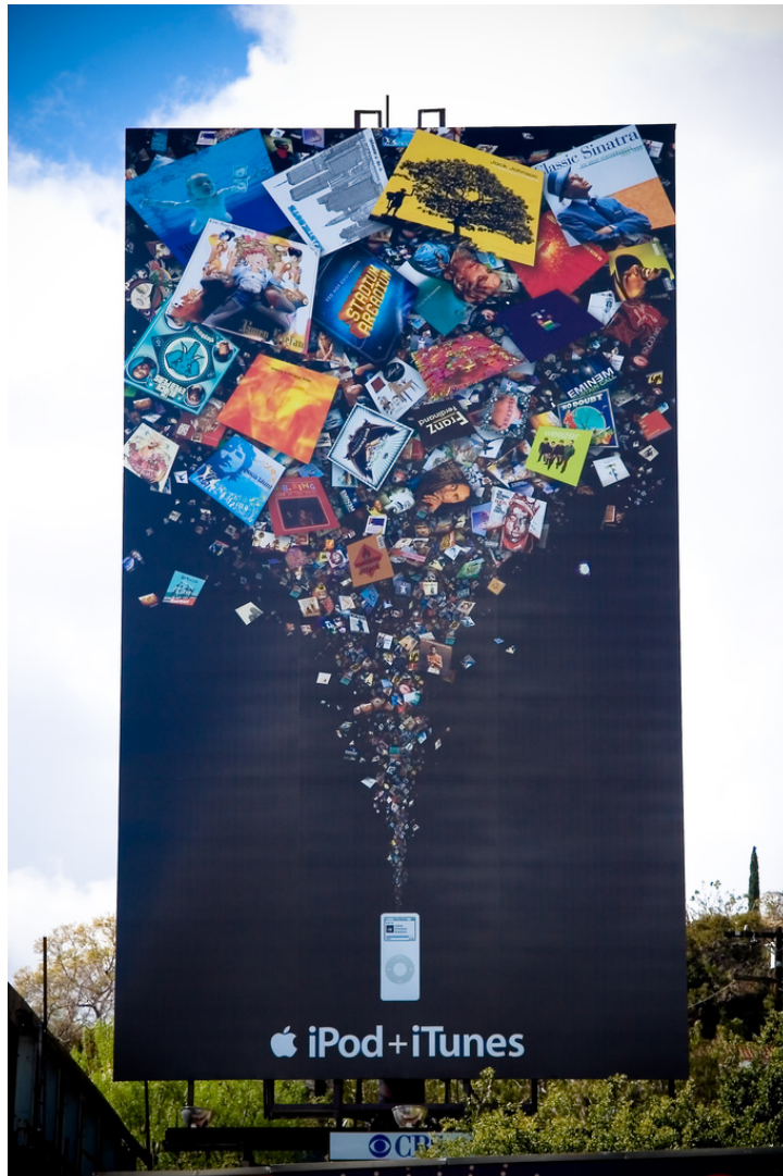
3. Music dematerialised. Apple billboard, 2005.

seeks 'the comfort of oblivion' (Ferguson, 2009: 165). As Peter Krapp (2004: xi) notes, while new media technologies make 'unprecedented forms of storage and access possible, the resulting mega-archive' may appear 'as the fulfilment of ancient fantasies of complete presence'. Indeed, as Jameson suggests, the phenomenological reduction to the present that characterizes much of contemporary life finds its only support in the notion of the eternal – to be out of time, in other