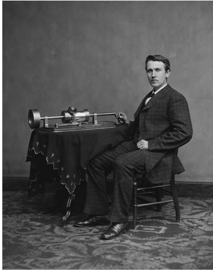
1. Thomas Edison with his Phonograph, 1877.